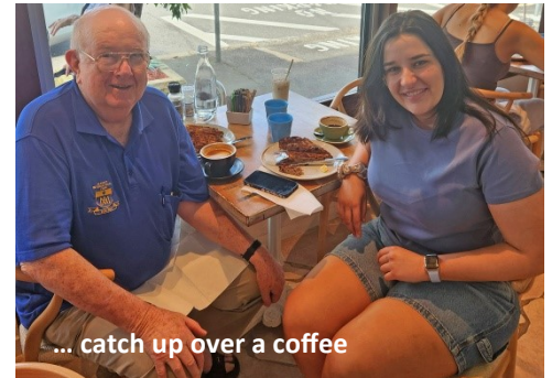
... catch up over a coffee