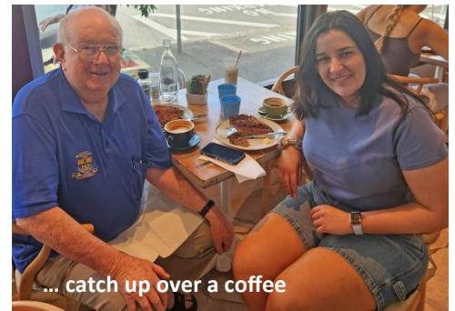
... catch up over a coffee